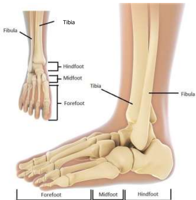
Figure 2: Ankle joint - Forefoot, Midfoot and Hindfoot.